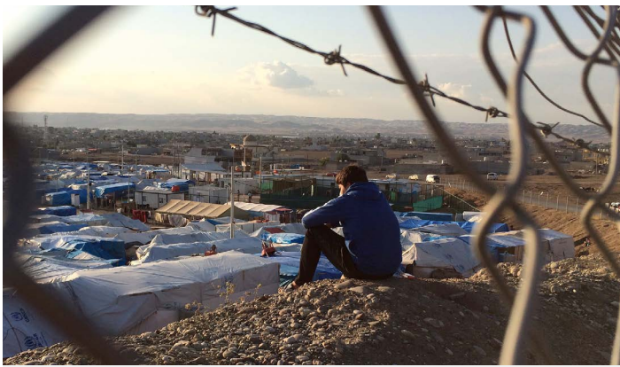
A man gazes towards Kawergosk refugee camp, Erbil governorate, Kurdistan region of Iraq. Built to accommodate 10 000 people the camp is full to capacity and currently houses around 13 000 Syrian refugees.